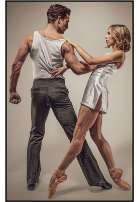
A Streetcar Named Desire