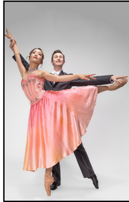
Moulin Rouge® The Ballet